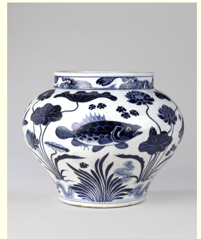
Wine Jar with Fish and Aquatic Plants , 14th century. Porcelain with underglaze cobalt blue decoration, 11 5 / 16 × 15 3 / 4 in. (50.5 × 54.9 cm). Brooklyn Museum; The William E. Hutchins Collection, Bequest of Augustus S. Hutchins, 52.87.1. Creative Commons-BY. (Photo: Brooklyn Museum)

This blue-and-white porcelain jar depicts a lively underwater scene. Four distinct fish swim around the belly of the jar. One (with a spiky dorsal fin) is a freshwater perch, and the remaining three are from the carp family. Each fish has an open mouth and a wide-open eye that looks straight out at the viewer. The textures of the scales and fins are rendered in exquisite detail. The fish are elegantly framed by a variety of water plants local to Jingdezhen: lotus, eelgrass, duckweed, water crowfoot, and pondweed. The leaves and stems of the plants and flowers twist and bend, suggesting the flow of water. A band of crashing waves circles the top of the jar.