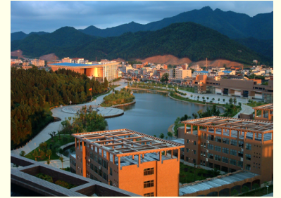
Click image to enlarge

Tell students that this part of China is known as the “porcelain capital” because it has been producing pottery for 1,700 years. Jingdezhen is close to China’s best-quality deposits of porcelain stone, which are found in the mountains that surround the city, and nearby pine forests provide wood for the kilns. The Chang River connects the city to river systems flowing north and south, facilitating the transport of fragile objects such as this wine jar. Porcelain was first developed in China, and it was highly sought after in other places. Blue-and-white porcelains, like the wine jar, influenced other artists all over the world, and are still being made today.